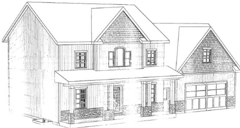
Figure 2: Concept Rendering

The property is currently developed with several greenhouses and a single detached dwelling and is intended to be developed with a second dwelling unit to accommodate farm help. The lands are zoned Specialty Crop (AS) under Bylaw 60 (2019) which permits second dwellings in accordance with the regulations contained in Table 9.4. The lands are designated Specialty Crop and are within the Protected Countryside of the Greenbelt Plan and Tender Fruit and Crop Area of the Niagara Escarpment Plan Area.