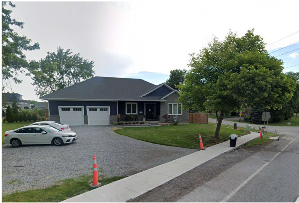
Figure 3: Existing single-detached dwelling street view from Beaverdams Road